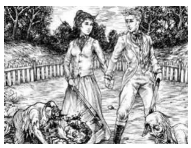
Figure 4. Philip Smiley

to empathize, since Grahame-Smith's characters are one-dimensional, violent, and lacking depth.