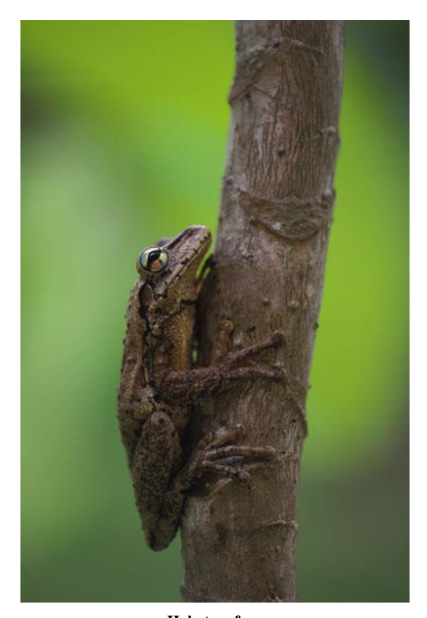
Hyla tree frog