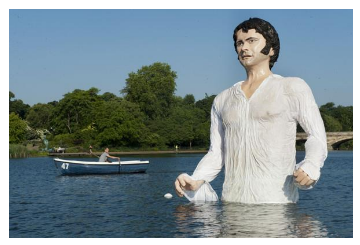
Twelve-foot statue of Colin Firth/Mr Darcy now emerges out of the Serpentine in Hyde Park, London, UK.