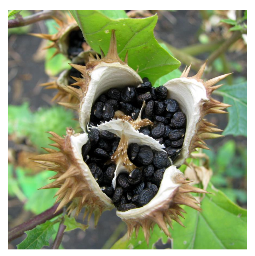
Datura stramonium or Devil's Cucumber