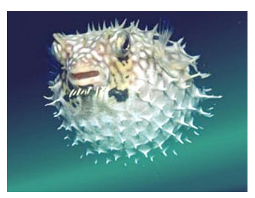
Fugu fish or Puffer fish