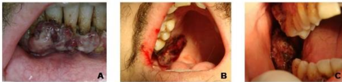
Figure 2: Clinical view of nodular exophytic lesion with erythematous, ulcerative surface in lower gingiva (A), soft palate (B), buccal mucosa and upper gingiva (C).

(sarcoma X carcinoma). Incisional biopsy was performed.